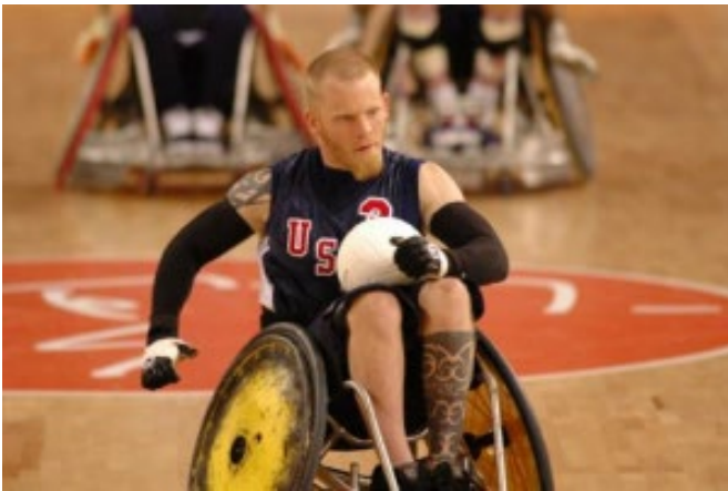
Mark Zupan pushing with ball.