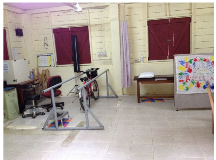
The PT clinic on-site at Hillside in Eldridge, Belize.